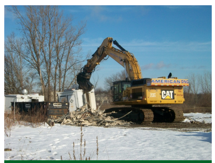
Hazardous Waste Locker Demolition