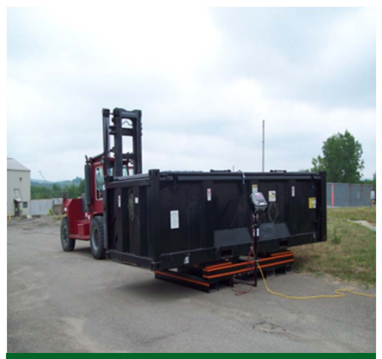
Preparing intermodals for demolition activities and loading of newly generated LLW