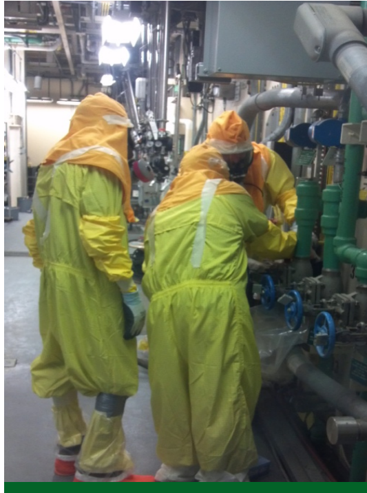
Out of Service Piping Air Gapping