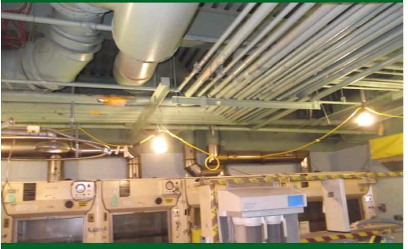
Radio-Chemical Lab Prepared for Asbestos Containing Material Removal