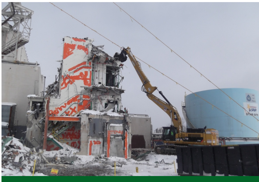
01-14 Building Demolition February 22, 2013 – Step 2