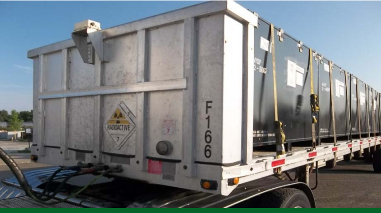
LLW shipment to Nevada National Security Site