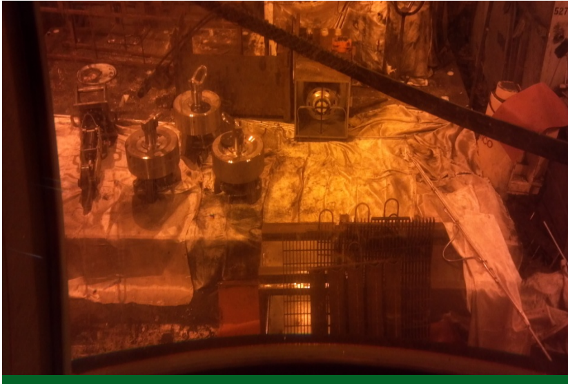
Vit Cell Equipment to be Size Reduced