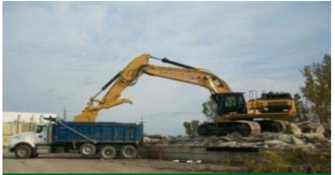
Waste Load Out of the Old Warehouse Pad